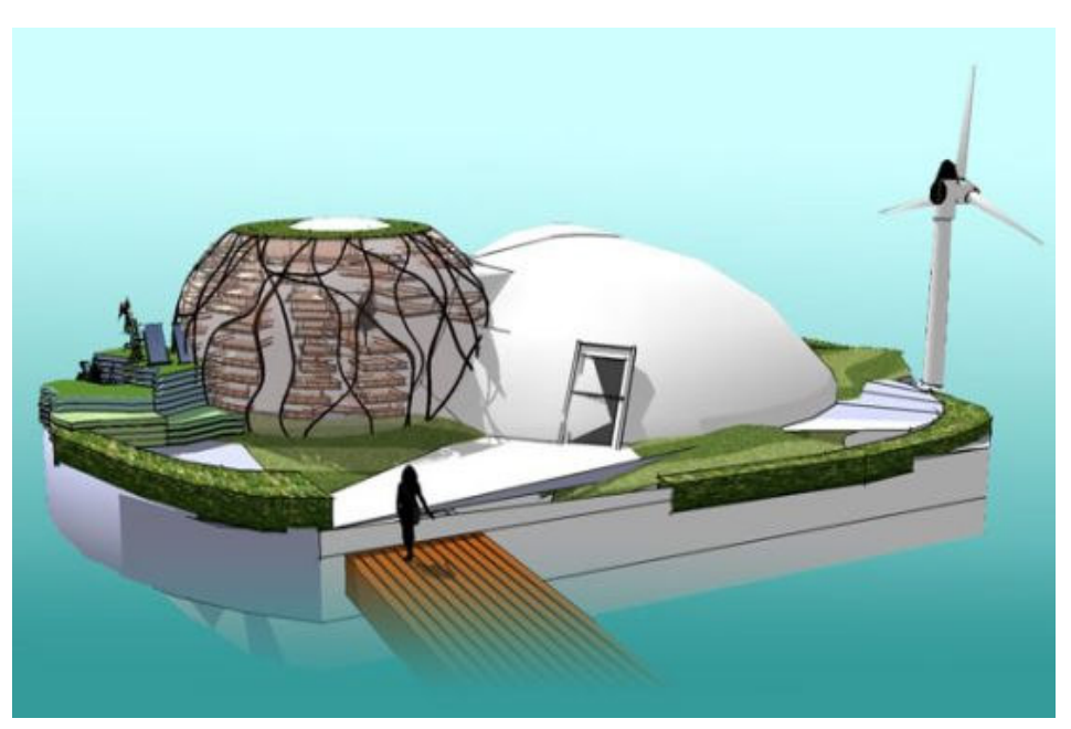
Waterpod floating house is a island that will fulfill all its energy requirements from natural sources