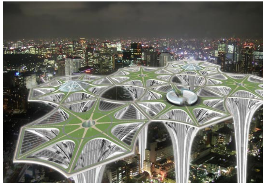
The skyscraper superstructure provides a new city layer above the old.